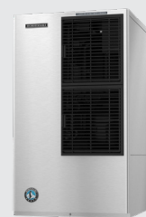
KM-660MAJ-E Top Kit: DB200H/KM Ice Production/24h: 280kg