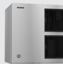
KM-470AJ-S Top Kit: None Ice production/24h: 480kg