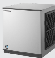
KMD-270AB Top Kit: DB200H/KMD Ice production/24h: 255kg